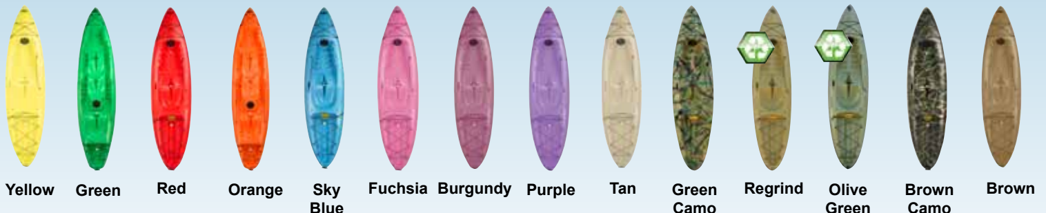
Yellow Green Red Orange Sky Blue Fuchsia Burgundy Purple Tan Green Camo Regrind Olive Green Brown Camo Brown

There are fourteen colors to choose from